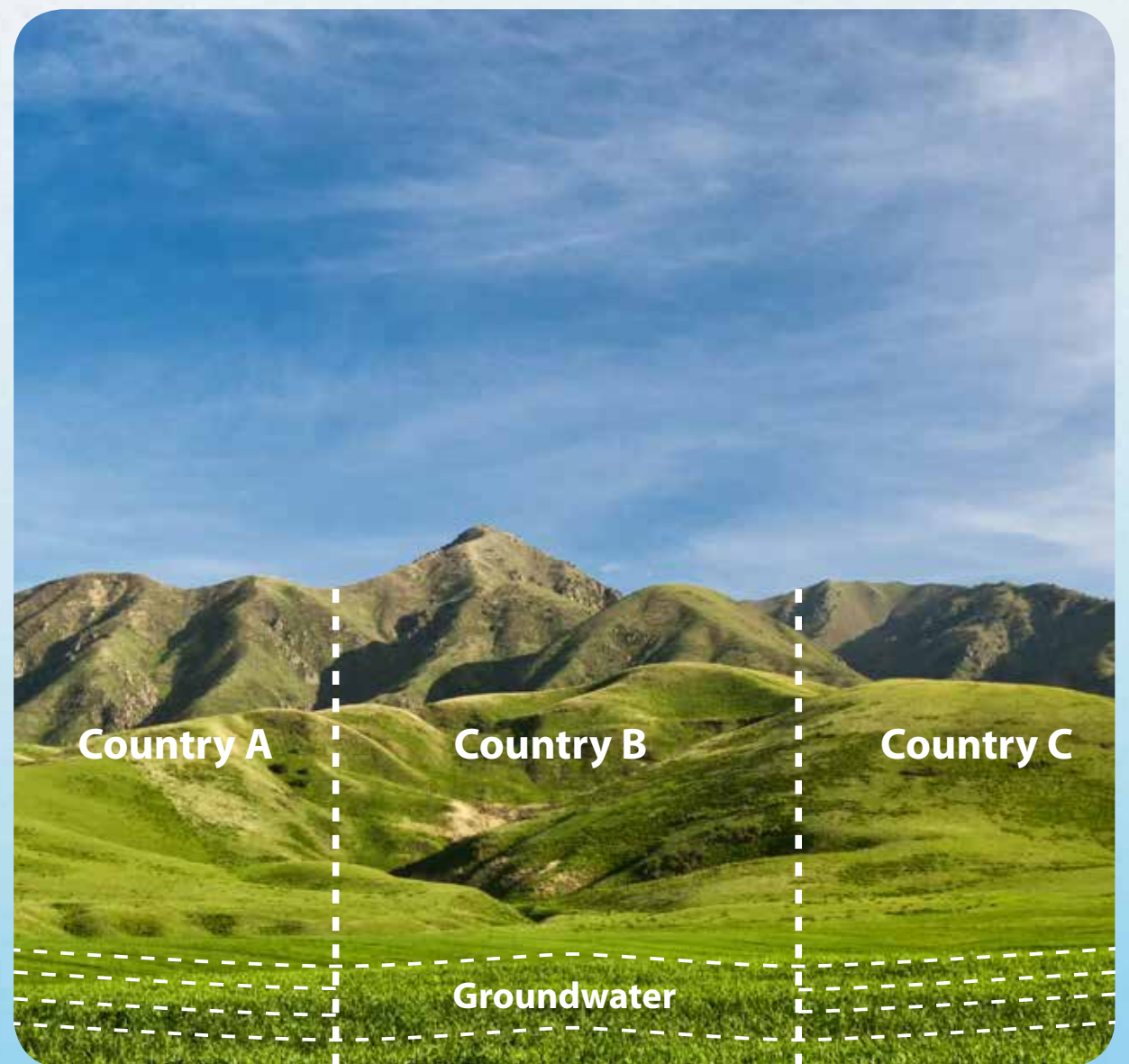
Transboundary Aquifers are shared by different countries